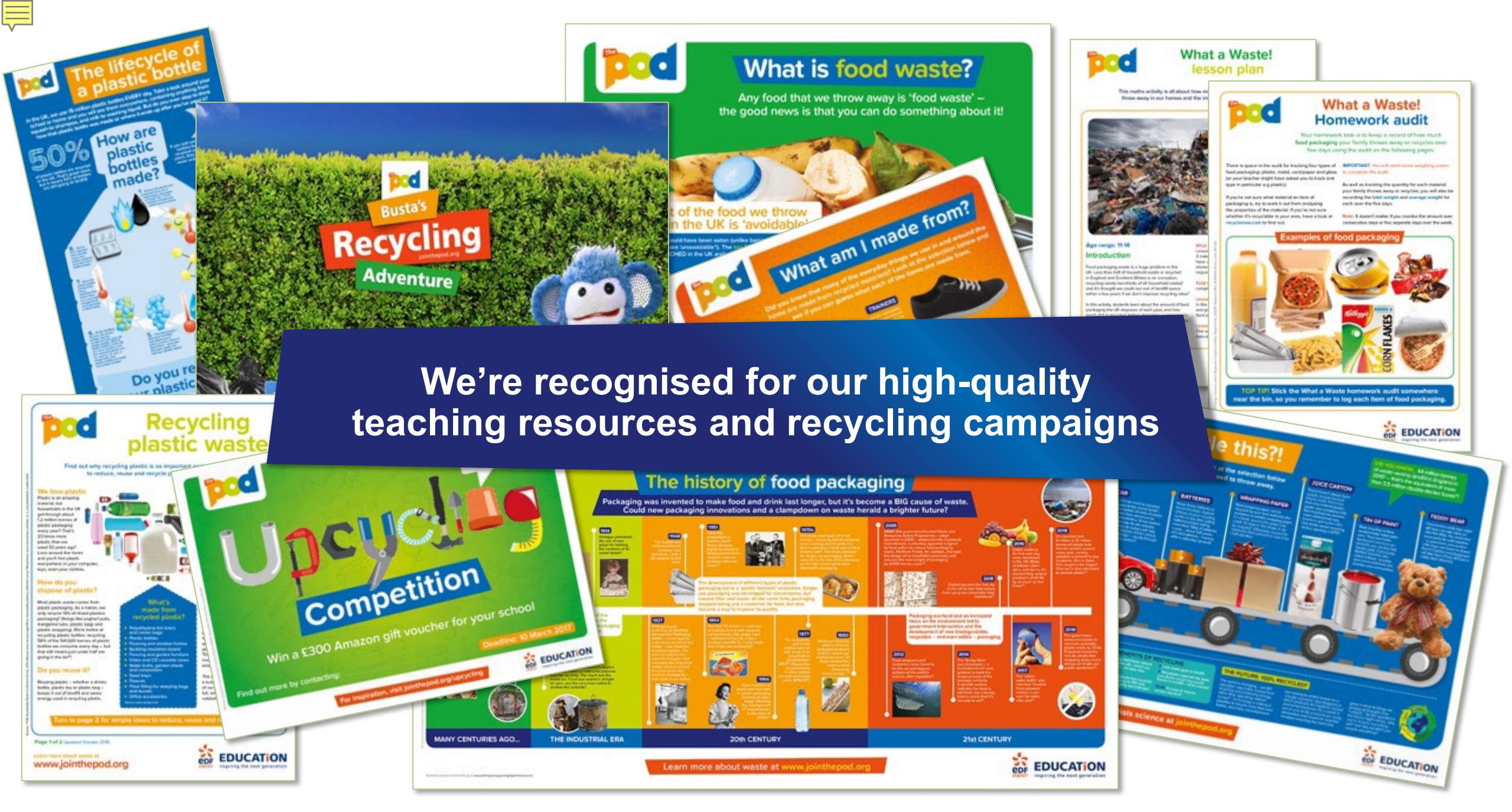
Our packs help teachers engage the whole school community